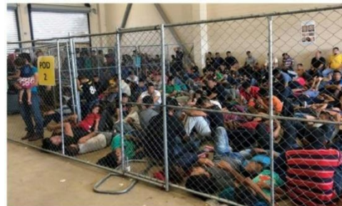
Figure 1. Overcrowding of families observed by OIG on June 10, 2019, at Border Patrol's McAllen, TX, Station.

Additionally, this administration has sought to reject targeted gang violence and domestic violence as valid reasons for claiming asylum, despite the UN Refugee Agency's determination that "forcible recruitment attempts, including under death threat, by violent groups would normally amount to persecution." 24 Further, in this time of crisis, this administration has engaged in a practice known as "metering," or capping the number of asylum claims, and is processing significantly less than the prior administration did. 25 People are then forced to wait in Mexico, in locations deemed unfit for travel by the State Department, where many are raped, robbed, killed, or kidnapped. 26 As Congressman Jamie Raskin notes, under this administration, "They have not been greeted as refugees whose asylum claims must be heard and taken seriously, but as presumptive criminals and threats to the American people." 27